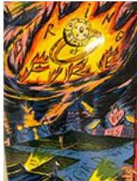
Burning of Fire Cycle or Welcome to Sinland, 1992 Offset, saddle stitch bound, 54 pages, 17 x 12 ½ in. NFS / Out of Print