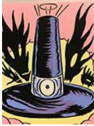
Pur-Ton-O-Fun-co, Scat-A-Log, Volume 2 Screenprint on paper, accordion bound, 9 pages, 10 ½ x 8 ¼ in. $175

140 58th Street Brooklyn, NY 11220 Instagram/Facebook/Twitter: @booklynart 718-383-9621