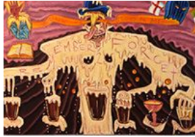
Remember Forget, 2018 Oil on canvas 24 x 36 in. $4,000

140 58th Street Brooklyn, NY 11220 Instagram/Facebook/Twitter: @booklynart 718-383-9621