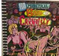
An Alphabetical Ballad of Carnality, 2006 Published by Fantagraphics, hardcover, 37 pages, 11 ½ x 11 ½ in. NFS / Out of Print