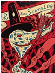
Pure Ton o' Fun-co S-Catalog Screenprint and risograph on paper, saddle stitch, 40 pages, 10 x 8 in. 11 x 8 in. $80