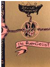
The AvenGelist, 2004 Cover Screenprint / Interior Offset printed, staple bound, 36 pages, 17 x 13 in. $50 (Newsprint version $5)