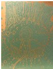
Aging Innocence, 2015 Risograph on paper, saddle stitch bound, 8 pages, 11 ½ x 9 in. NFS / Out of Print