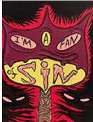
Pur-Ton-O-Fun-co, Scat-A-Log, Volume 3 Screenprint on paper, accordion bound, 9 pages, 10 ½ x 8 ¼ in. $175