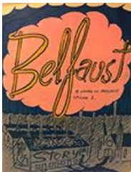
Belfaust, A Novel in Progress, Episode 1, 2018 Screenprint on paper, saddle stitch bound, 21 pages. 11 ½ x 9 ¼ in. $20