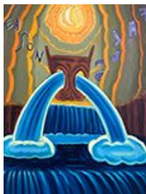
[T]Reason Falls, 2019 Oil on canvas 30 x 24 in. $3,500