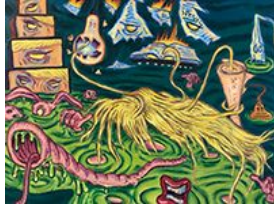
Swamp-Gas Monster, 2019 Oil on canvas 24 x 30 in. $3,500