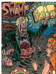
Swamp Preacher, 2006 Saddle stitch bound, 39 pages, 11 ½ x 9 in. NFS / Out of Print