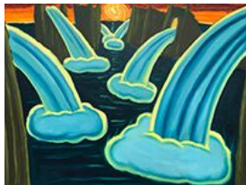
Infinity Falls, 2018-19 Oil on canvas 24 x 36 in. $4,000