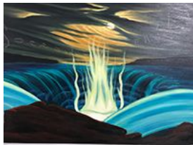
Sorrow Falls, 2002 Oil on canvas 24 x 36 in. $4,000