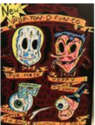
Pur-Ton-O-Fun-co, Scat-A-Log, Volume 1, 2011 Screenprint on paper, accordion bound, 9 pages, 10 x 7 ¾ in. $175