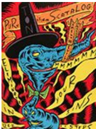
Pure Ton o' Fun-co S-Catalog, 2015 Screenprint on paper, coptic stitch bound, 47 pages, 10 x 8 in. NFS / Out of Print