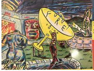
Land of 1000 Beers: Travel Guide to La Via Dollarosa, 1988 Screenprint on paper, comb bound, 38 pages 10 ¼ x 13 ¼ in. $65